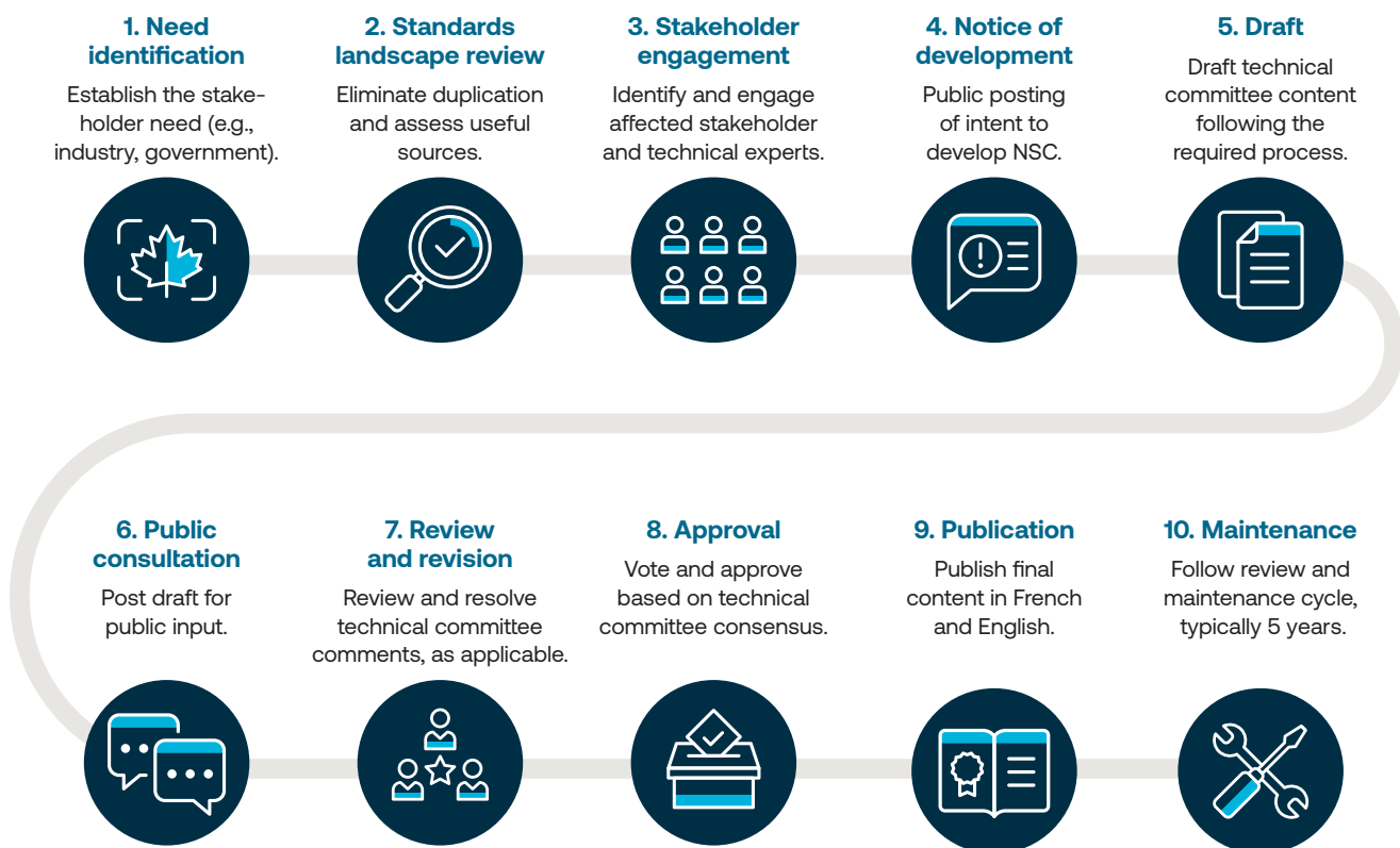
Figure 2: Standards setting process for a National Standard of Canada

Standards are developed through a process of consensus and review by stakeholders from industry, governments, academia and the public. Such processes begin by identifying needs for a given sector that are then planned for by the relevant organization and committees. For purposes of illustration, the figure below shows the standard development process for a National Standard of Canada. This is just one example. Over the course of our mandate, the system has developed a series of flexible and agile processes for standards activities.