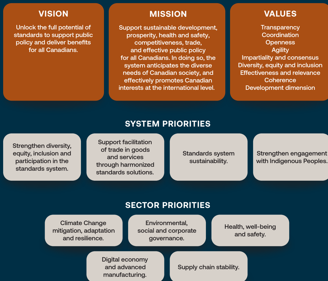
Figure 3: The National Standards Strategy

Given the foregoing, we are pleased to present a summary of the NSS below in Figure 3.